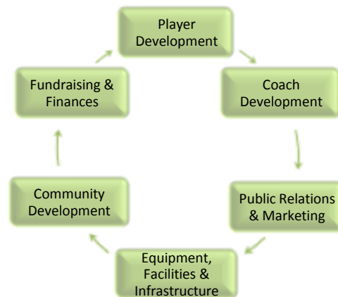
Figure 1 – AYFC Development Model